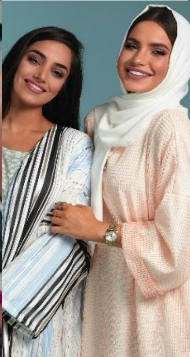
Modest Fashion & Lifestyle