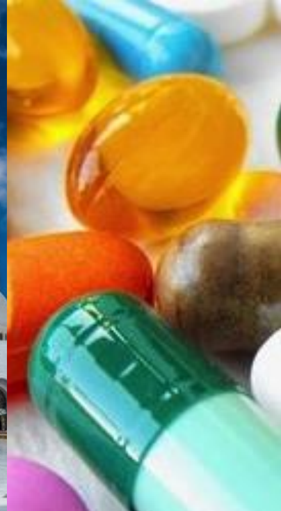
Halal Pharmaceuticals & Cosmetics