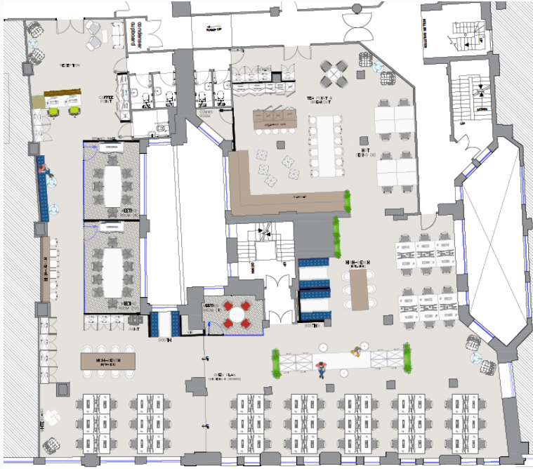
Sample space available in London E1

A dedicated mixed use location in central London