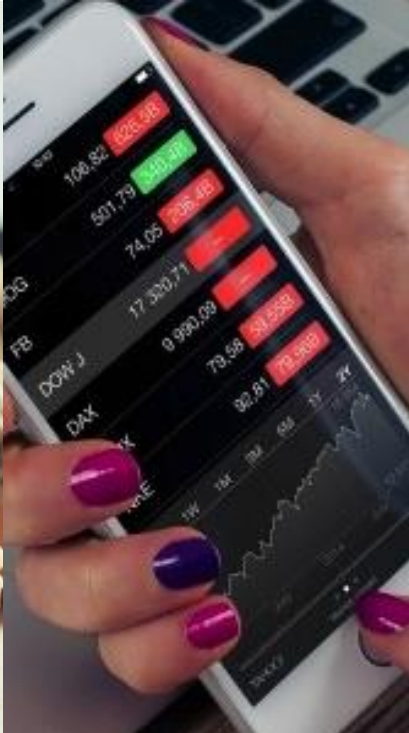
Islamic Finance & FinTech